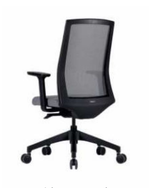
Without Headrest (LM-050C)