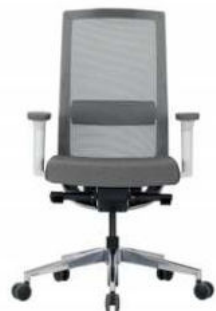
Without Headrest (Q750C)